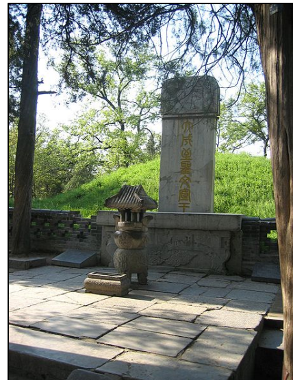
Tomb of Confucius in Qufu, China