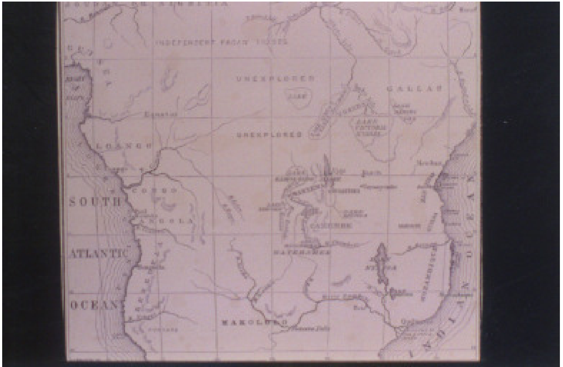
Slide F: Sketch map of Central Africa, showing Dr. Livingstone's exploration