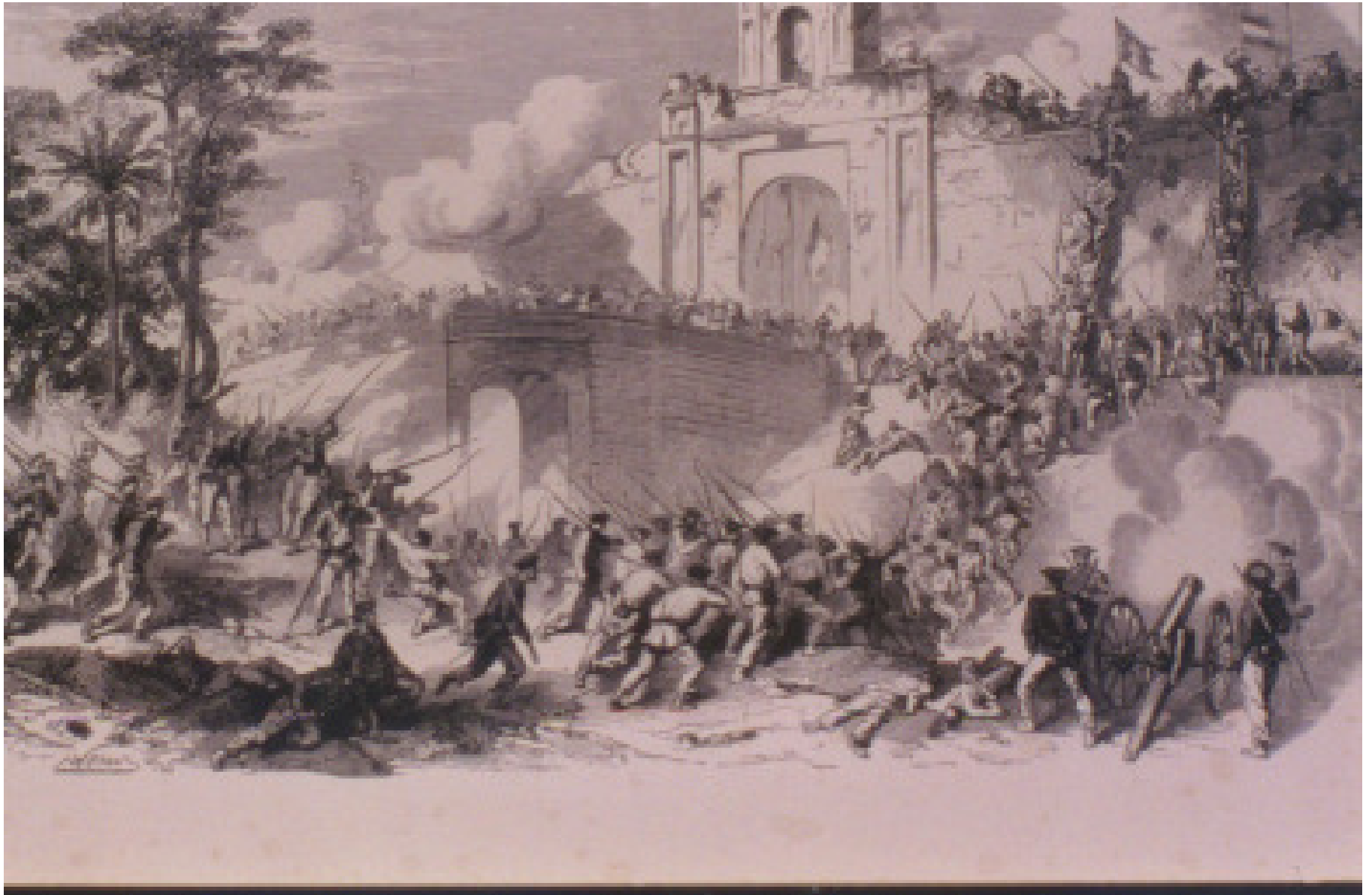
Slide K: French capture of the citadel of Saigon, Vietnam