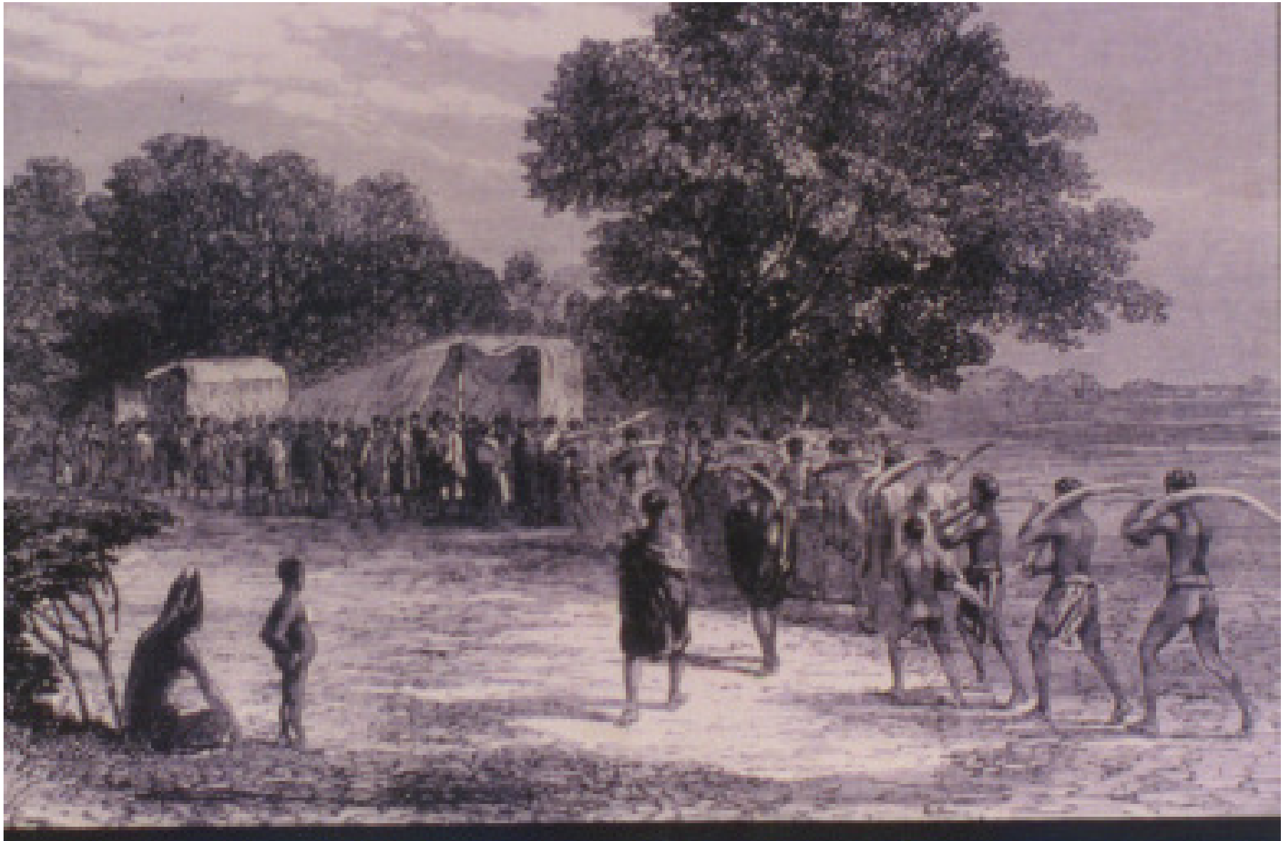
Slide E: Africans bringing ivory to the wagons in South Africa, c. 1860