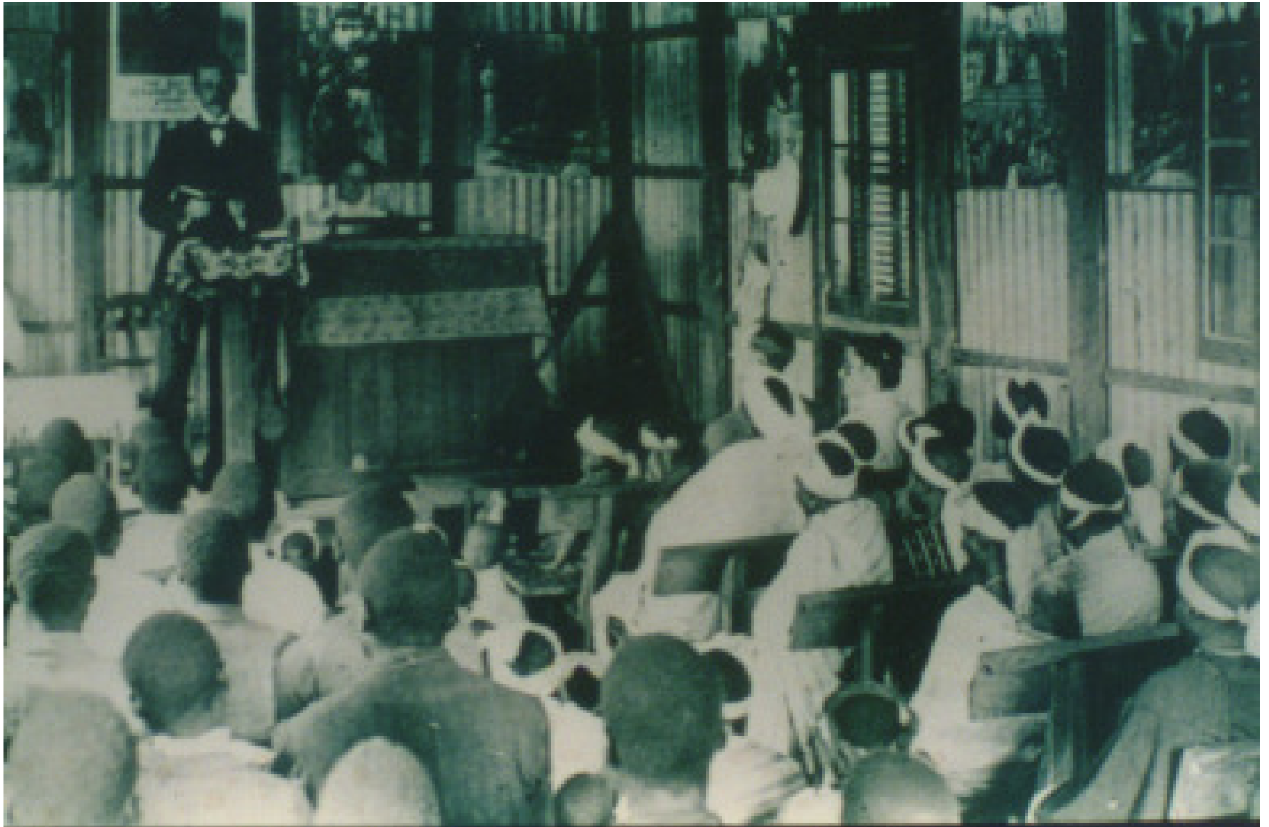
Slide B: A Methodist Sunday School at Guiongua, Angola, in 1925