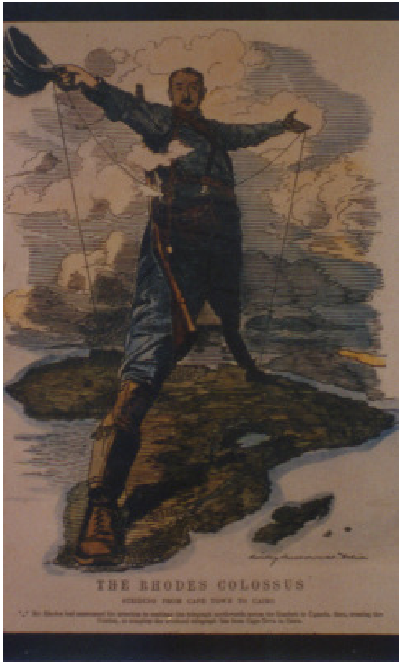
Slide M: British cartoon “The Rhodes Colossus,” showing Cecil Rhodes’ vision of making Africa “all British from Cape to Cairo,” 1892