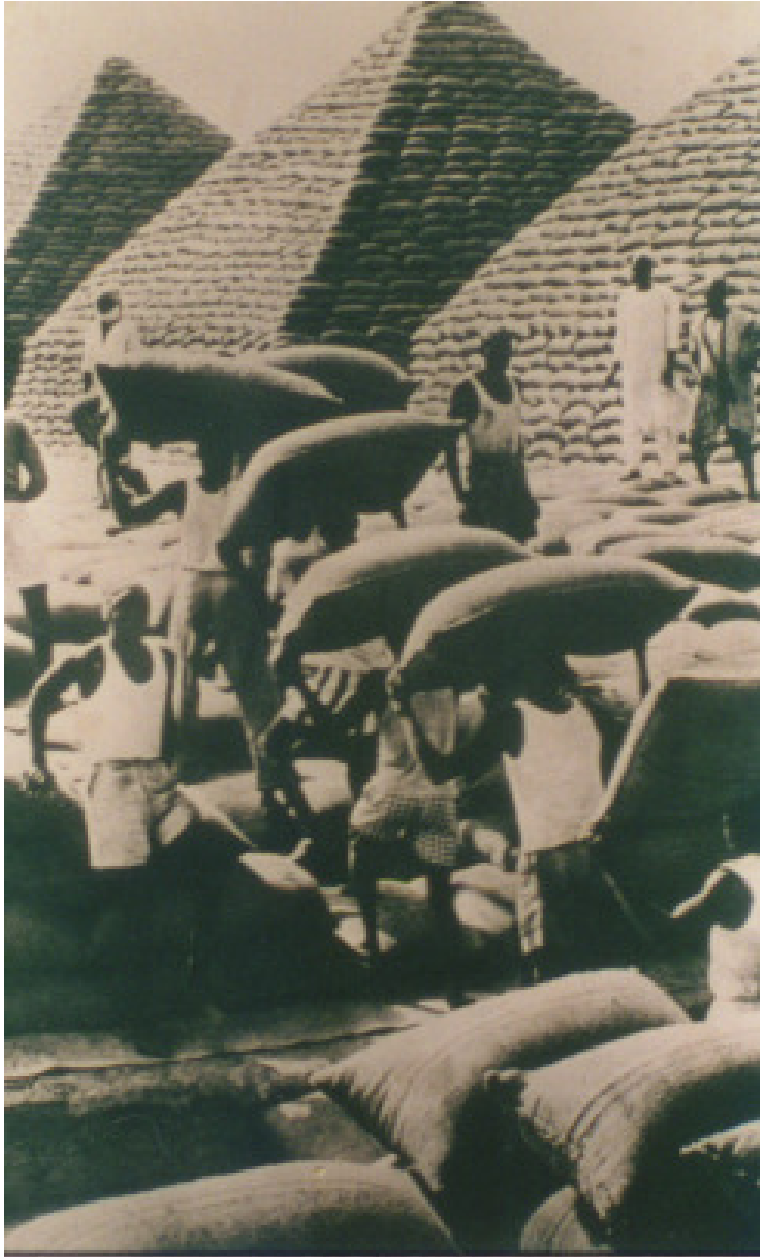
Slide J: Bagged groundnuts in pyramid stacks in West Africa