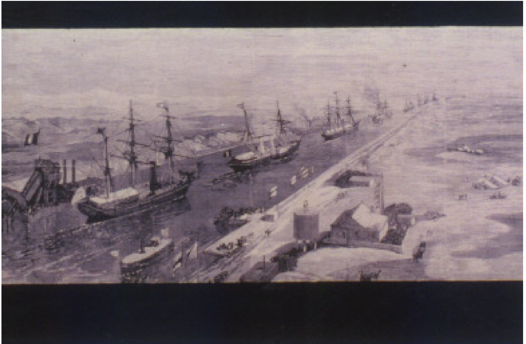
Slide O: An imperial yacht passing through the Suez Canal in Egypt at the opening of the canal in 1870