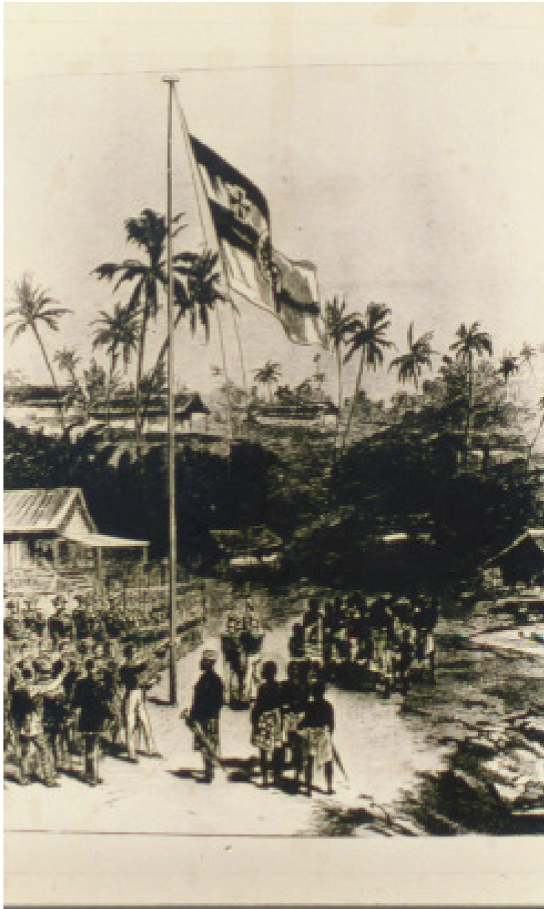
Slide C: Germans taking possession of Cameroon in 1881